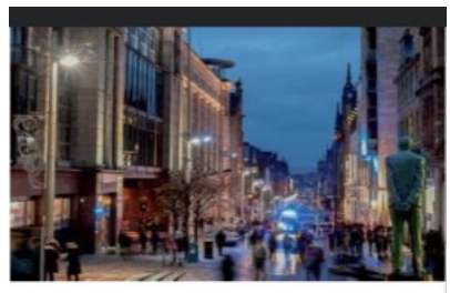
Volunteer with Glasgow Street Pastors